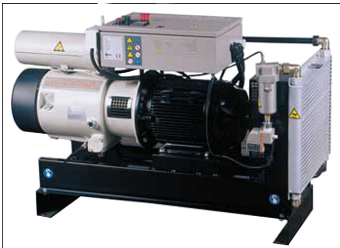
Mattei air compressors are high quality systems capable of positively impacting business operations and their bottom line.