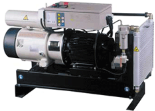
Mattei air compressors are high quality systems capable of positively impacting business operations and their bottom line.